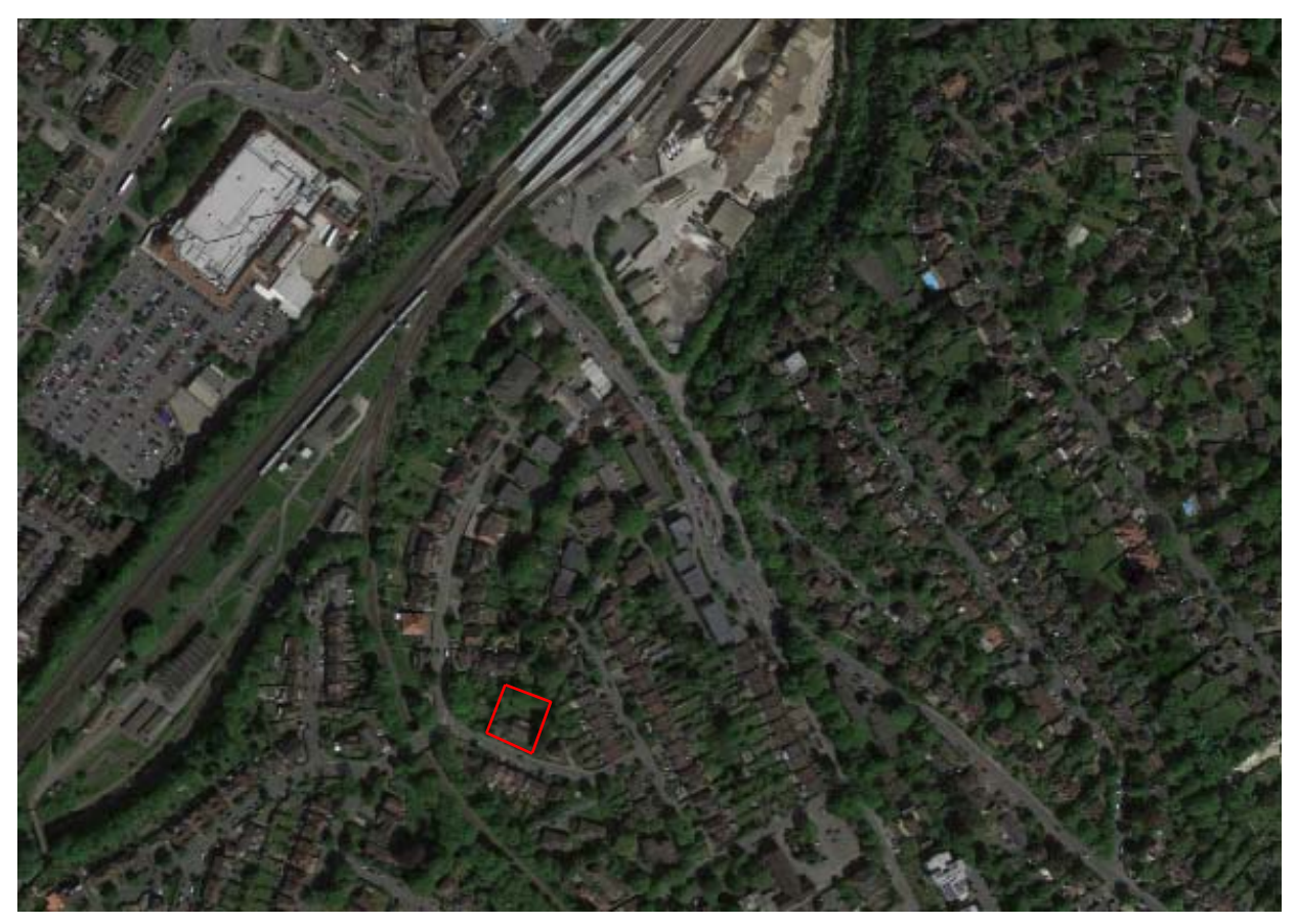
Fig 1: Aerial street view highlighting the proposed site within the surrounding streetscene