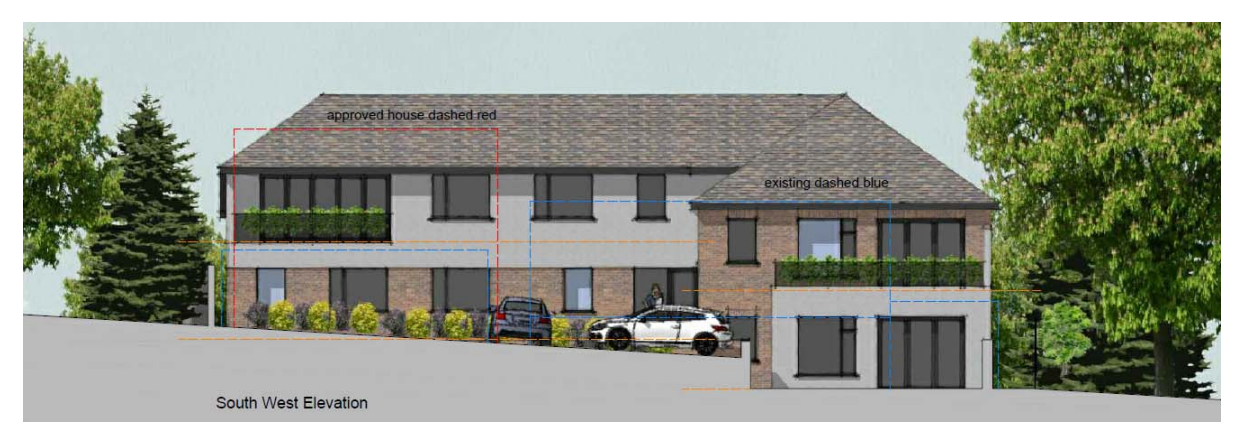
Figure 1: Proposed Front Elevation

changes. The site is very individual in its nature, and is one of only two buildings on this side of the road. The proposed design approach is sympathetic to the surrounding area whilst respecting the overall topography of the area (with the ground, and built form, falling to the north and east. The design deals with the constraints of the site whilst maximising the number of units to be provided.