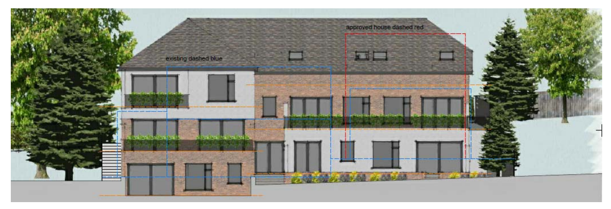
Figure 2: Proposed Rear Elevation

8.8 Whilst balconies are proposed within the front elevation these are sensitively considered and where possible integrated into the built form. Figure 1, shows the existing built form indicated within a blue line with the extant permission for two storey house shown by the red dashed line where the existing garage is located. At the rear of the site, shown in figure 2, the proposal would be two/three storey owing to the split level approach of the development and utilising the land levels which fall away both west to east and north to south.